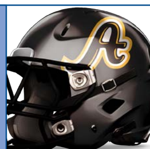
AMERICAN INTERNATIONAL (0-2, 0-0 NE10) YELLOW JACKETS